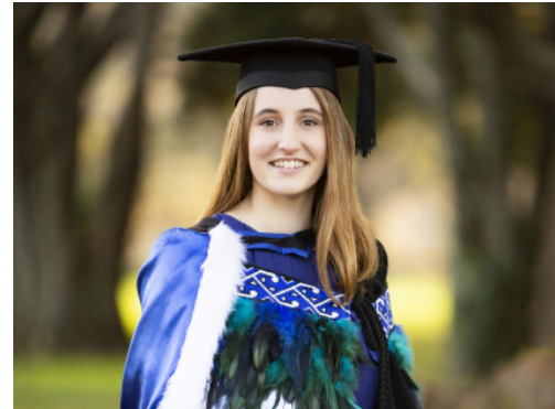
Model wearing University of Auckland BSc Regalia with the Korowai Provided by Academic Dress Hire and Timeless Images