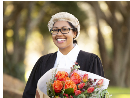
Model wearing Legal Regalia